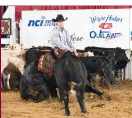
Left: Smartys Shadow Right: Travs Scooter