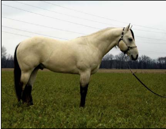
Too Slick Two Watch

This year's AI breeding is Too Slick Two Watch x Famous Flirt Girl. Too Slick Two Watch is performing in rodeo events and earned 56 AQHA points in three different events. He is a very quiet minded stallion with a superb conformation and abundant athletic potential. You might check this wonderful stallion out online at www.suziedavis.com . We look forward to this very special foal (96 % FQHA).