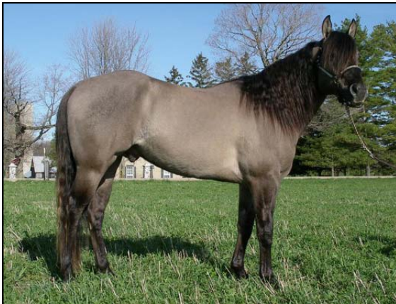
Ka Cee Smoker

This year's newcomer in the broodmare band is MJG Blue Eyce Chex. Being a very well put together horse herself, she should cross excellent to Smoker. The foal of course is foundation eligible: FQHA: 97%