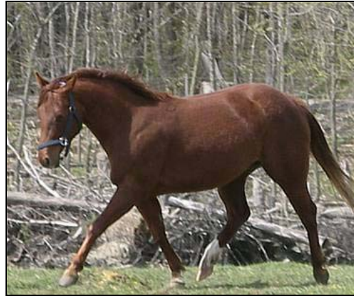
Famous Flirt Girl