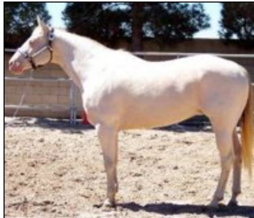
MJG Blu Eyce Chex