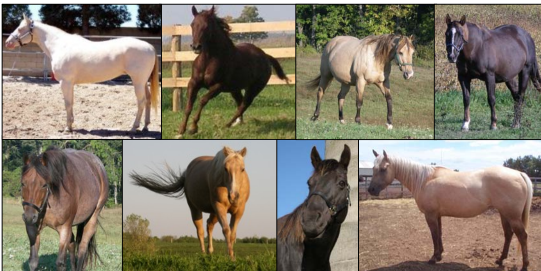
Top: MJG Blue Eyce Chex, Famous Flirt Girl, Stormy Sey Reed, Freckles Poco Bars. Bottom: Magic Button Twister, Docz Good Susan, Macks Black Pearl, CLF Zans Legacy

They all are good and caring mothers, foal easily and don't mind us handling their foals. For further information on their foals, please refer to the Offspring Section. Please find their pedigrees in the following section.