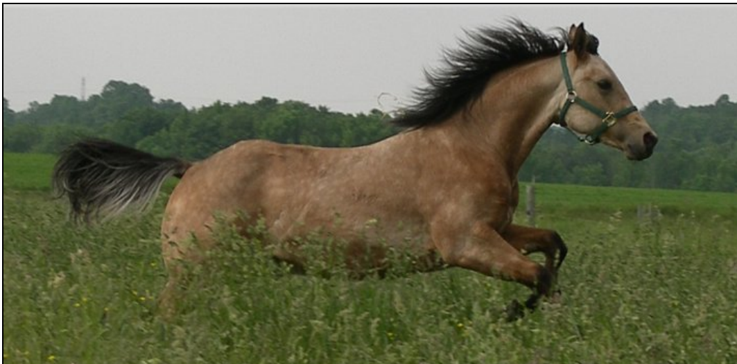
RVVR Quick Dominick

Ka Cee Smoker 2002 silver grullo Mills Dark Smoke 1981 silver grullo IBHA & ABRA Champion, ROM in Western Pleasure Days Dusty Colonel 1972 dunalino Ka Cees Cabin Bar 1983 grulla Lindie Star Ruby 1974 dun Primary Pine 1990 sorrel, H- 0.0 P- 1.0 NRHA 38'463 $ His Daughters Offspring Earnings: $210,457.00+ Silver Cabin 1975 chestnut Famous Flirt Girl 2001 sorrel Panhandle Paula 1971 grulla Flirting Blond 1977 sorrel Great Pine 1966 sorrel, Hall of Fame H- 25.0 P- 26.0 Amie's Ace 1972 bay H- 0.0 P- 16.0 Blondy's Dude 1957 sorrel H- 45.0 P- 12.0 LA Perada 1964 chestnut