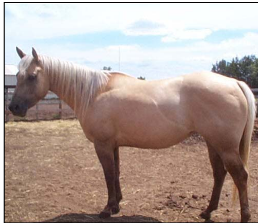
CLF Zans Legacy