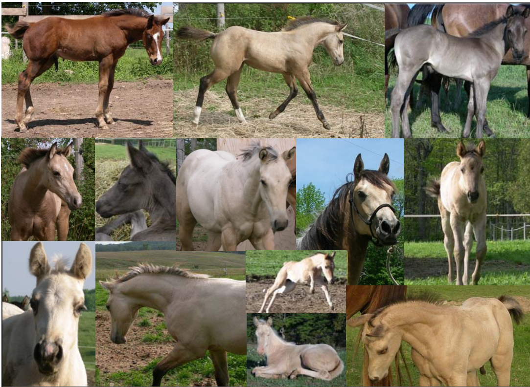
Foundation bred AQHA foals sired by Ka Cee Smoker.

Docz Good Susan was exposed to Ka Cee Smoker. She might be in foal.